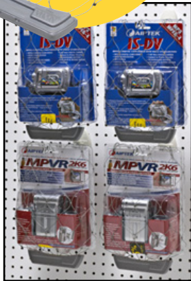
The Spider Web has a thin, sleek design that won't impede graphics.