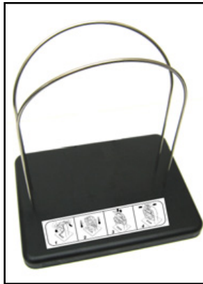
The Spider Web Loading Fixture makes loading irregular shaped merchandise quick and easy.