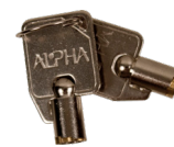
Barrel Keys for Locking (AF3303)