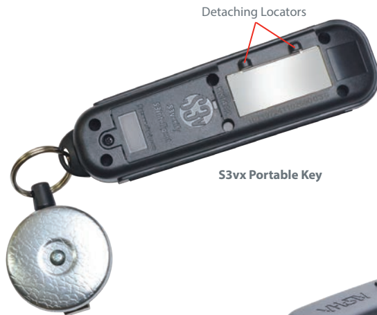
S3vx Portable Key